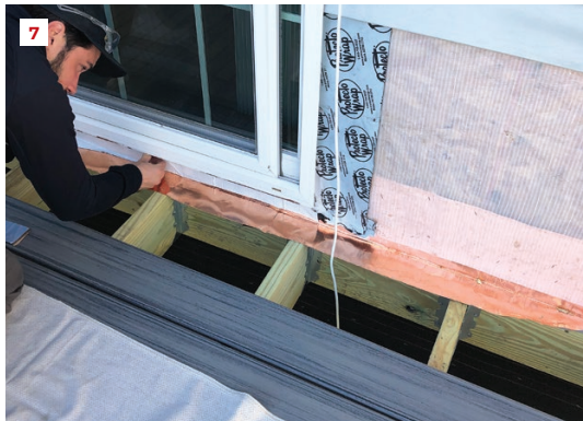
L-shaped copper flashing (yorkflashings.com) is installed on top of the ledger along the deck-to wall juncture. The new deck was raised 4 inches to decrease the step down from the sliding door (7).