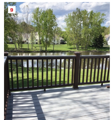
The free-standing deck is supported by a pair of double PT 2x12 drop beams and four 6x6 posts (8). While the condo association approved the new Trex composite decking, the posts and railings needed to be dark brown to match the original deck (9).