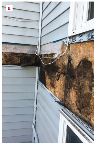
While the existing deck displayed no outward signs of instability (1) , the ledgers had not been properly flashed and the underlying OSB sheathing was revealed to be water damaged upon removal (2) .