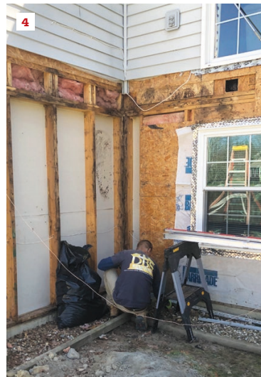
The end-wall sheathing was severely deteriorated (3) , and removing the water-damaged materials revealed that the floor framing had been installed without rim boards; a square hole (top right in photo) was cut into the outboard I-joist to verify floor framing direction (4) .