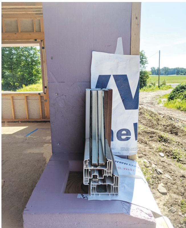
A mockup of the author’s window installation shows the insulated window buck and the window’s location near the wall’s center of mass.

levels of efficiency. To find the values in the table below, I input the psi values from Flixo into the PHPP. You can see that the difference in the window position carries through to the annual heating demand for the entire house. In this example, keeping the windows in the center is the only option that allows me to meet the Passive House criterion for heating demand, 4.75 kBtu per square foot per year. Setting the window to the outside was worse, and setting it to