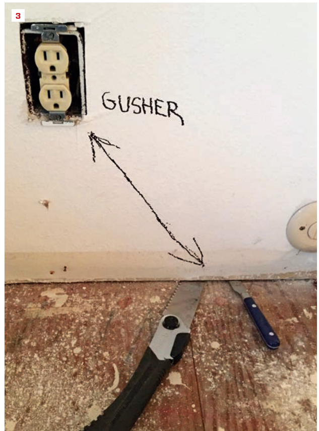
Working from the inside, the author probed with a strap tie to reveal the worst leaks in the house at the bottom plates (1) . At one place, where an exterior door was being replaced, the complete path of the air leaking into the wall cavity is revealed (2) . During an early blower-door test, the air flowing through this outlet and from the crack at the base of the wall gushed air (3) .

that come up in new or retrofit work. It is fast and nontoxic, works for all leak types, and emits no VOCs. It is a rubberized latex (elastomeric) mixed with fibered granules and sprayed onto surfaces with a texture gun.