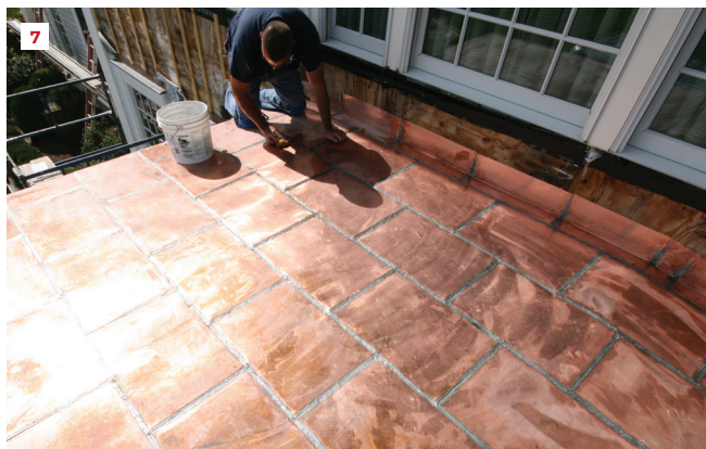
A weighted dead-blow hammer is used to flatten the seams (4). Uphill pans overlap the edges of lower pans (5). Only install as much copper as you can solder in a day (6). The acid from the flux must be neutralized, or it could cause the copper to prematurely (and unevenly) patina (7).

seams. For “starter” pans, we left the bottom edges unbent in order to fold them over the perimeter drip edge. For the “end” pans, we left either the right or left side unbent. We fabricated the drip-edge ourselves in the shop and left the roof-to-wall pieces to be site-bent.