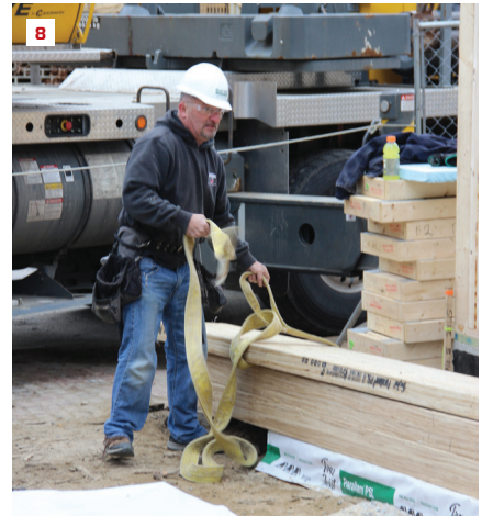
Controlling the heavy steel beam with a tag line, the crew gently lowers it into place across the garage door opening (4). A carpenter marks the 2x6 plate for a bolt hole (5); the plate is then drilled (6) and bolted down to the steel beam (7). A crew member attaches a lifting strap to a PSL beam in preparation for lifting the beam onto the walls (8).