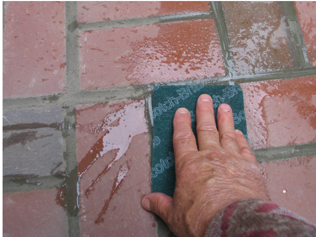
Figure 8. With careful work and timing, Scotch-Brite scouring pads (green synthetic steel-wool pads) and water, rather than harsh chemicals, can be used to scrub the bricks clean.