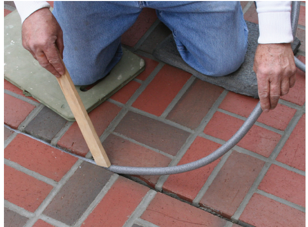
Figure 9. Foam backer is inserted in the open expansion joints to prevent sealant from sticking to the bottom of the joint. Rescissing the top of the backer rod about \frac{3}{8} inch below the top of the joint will ensure that the joint depth will be the same as the joint width.