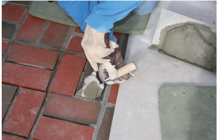
Figure 5. Grouting is a separate process. After cutting a 1/2-inch-wide slice from the flattened mortar on the hawk, position the slice over the joint, then push it into the joint with a small margin trowel.

When I finished jointing the bricks, they looked pretty bad. The surface was littered with mortar crumbs, and large fins of mortar rose up from the edges of the joints. Some of the bricks had