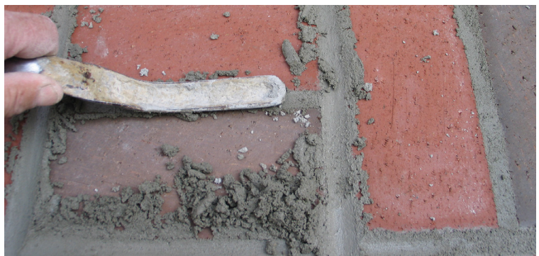
Figure 7. Once the grout joints are packed full and have set up a bit, they are dressed with a concave jointer. Pressing hard against the jointer as it is run over the joints packs the mortar tight and gives the top of the joint a neat, concave profile.