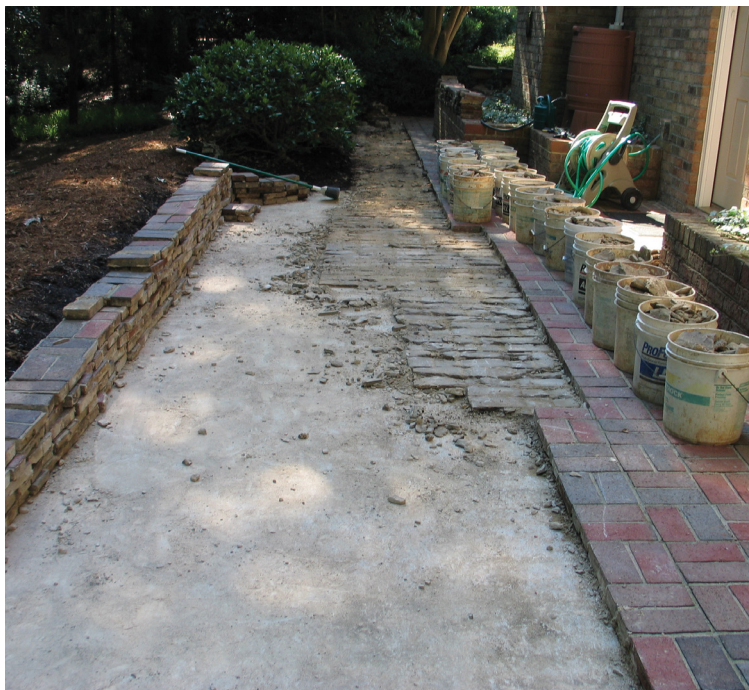
Figure 1. Installed in 1996, this North Carolina brick patio began to come apart within 10 years. But what started out as a repair of a few loose bricks turned out to be a major replacement job, thanks to faulty installation details and poor drainage.

After embedding the first half of the membrane, we rolled back the other half and repeated the process. In about six hours, we had covered a third of the slab—the part with the large settlement