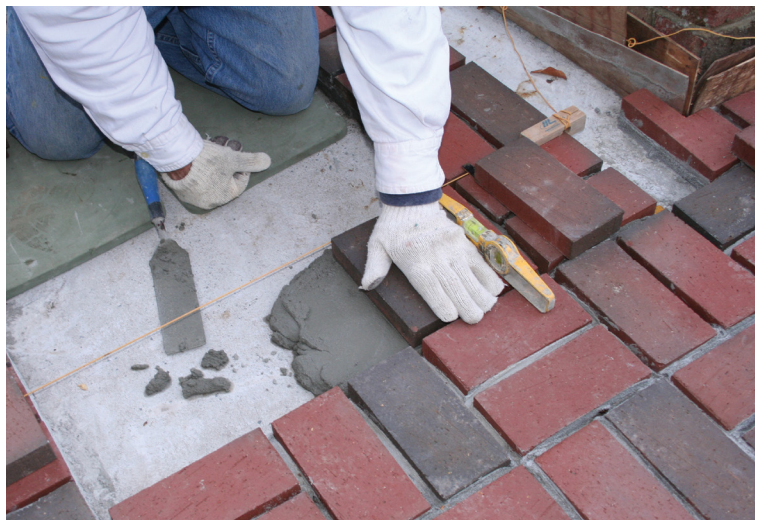
Figure 4. Brick pavers should be tapped or pressed into a full mortar bed, but avoid sprinkling the face of the bricks with mortar and staining them (a common problem when using a trowel handle). A torpedo level is handy for determining when the brick is even with its neighbor.

Flexible brick paving is a lot cheaper than rigid paving, is easier to build and repair, and—perhaps most important—accommodates movement. But rigid brick paving has its own advantages: It has a very even surface, and weeds don't grow up through the cracks. When installed properly, rigid brick paving lasts indefinitely in climates like mine; here in North Carolina, I've installed dozens of mortared brick paving jobs, some of which have been through more than 25 winters without losing a brick or showing any deterioration in the mortar joints. —J.C.