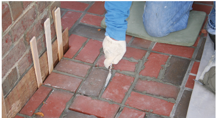
Figure 6. As the joints are filled with grout, they should be packed with a tuck pointer. It typically takes several passes of filling and packing before the grout joints are completely filled up.