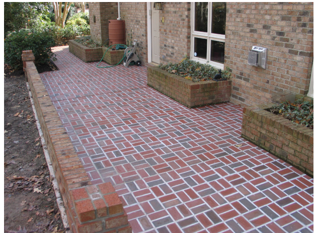
Figure 11. Rigid brick-paver surfaces are smooth and weed-free, and well-suited for moderate climates that don't experience many freeze-thaw cycles.

mortar smudges at the edges. But from experience, I knew that any attempt to clean the mortar while it was still fresh would do more harm than good. I called it a day and went home, knowing that I could make this day's handiwork shine the next morning.