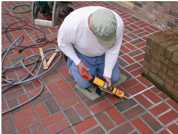
Figure 10. Expansion joints are then filled with a premium-grade polyurethane sealant.