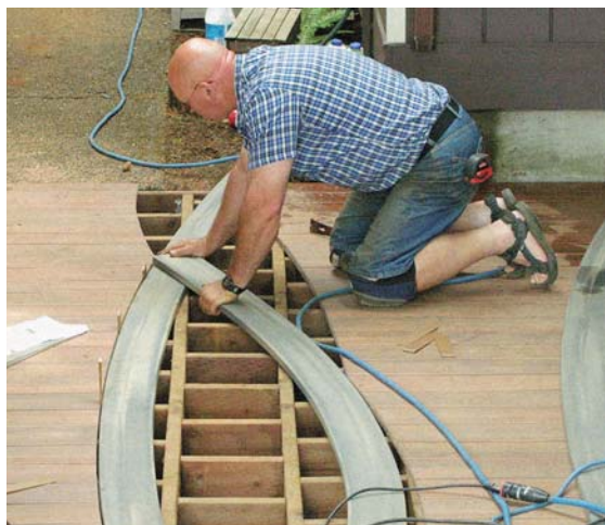
Figure 5. The curved decking of the inlay was used as a pattern to mark the field decking for cutting. Then, the curved pieces were laid in place and marked for cutting from below.