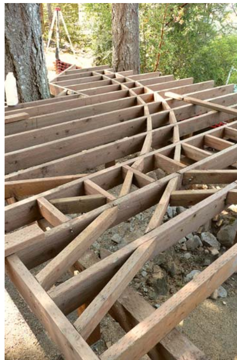
Figure 3. Blocking parallel to the joists for the long inlay on the upper deck was relatively simple (above left), but blocking the curved section on the lower deck took a lot of layout and numerous individually cut pieces (above right).