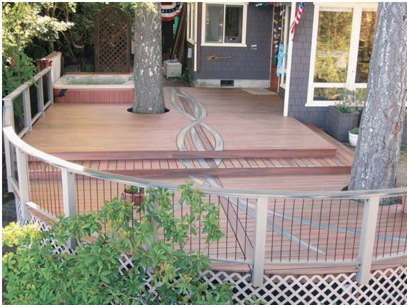
Figure 2. Though there weren't many pieces of decking in this curved inlay, the amount of time spent blocking, bending, and cutting them out took the author by surprise.