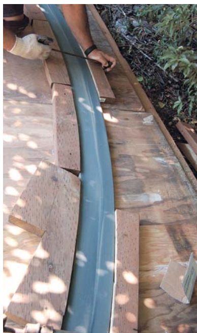
Figure 4. With proper heating equipment, bending composite decking is possible, but demanding.

is Fiberon Tropics Jatoba (800/573-8841, fiberondecking.com). To create the inlay, I “wove” three pieces of Fiberon Tropics Cypress decking around one piece of Tropics Mahogany and made the pieces of Cypress curve off in different directions, like reeds growing in a lake. The pattern bridges two levels of the deck and provides a