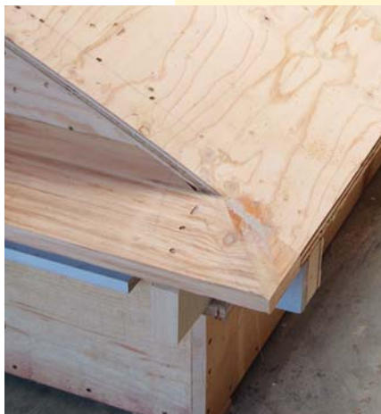
Figure 3. The roof was made in two pieces, a front rectangular section (top) and a rear section (above) cut out to wrap a projecting bay. The sheathing was applied in three layers, stepped back at the joint between the sections to allow for a strong overlapping layer of sheathing to be applied on site. The small overhang across the front of the roof (left), made from cedar, was blended at the corners with a filler of epoxy and sawdust, then sanded flush.