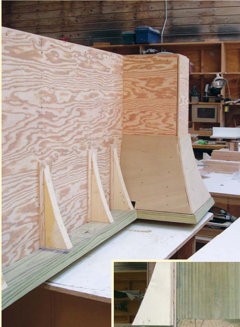
Figure 4. The flared L-shaped half walls (above) were built on pressure-treated plates (right) that were carefully machined to fit matching plates attached to the deck framing. The wall sheathing runs past the bottom plate to create a captive flange for the base plate, so that the wall could easily be dropped into place on site.