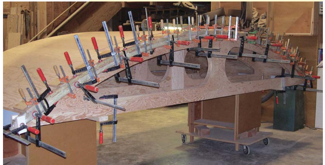
Figure 6. Kerfed lumber was used for the semicircular deck frame (top left), which became a bending form to make the curved treads. The author ripped 1/4-inch-thick strips of meranti decking, then laminated them with two-part epoxy. Poly sheeting contains the squeeze-out and prevents the clamps from becoming permanently bonded to the wood (top right). In similar fashion, the roof module was used for bending the arched trim (above).

With a crane standing by, we loaded the components on a flatbed trailer and towed them to the site. We first lifted the deck frame into place, leveling and shimming it, then bolting it to the building with LedgerLok screws (800/518-3569, fastenmaster.com ).