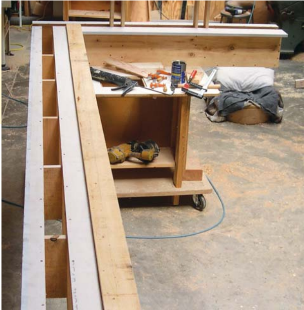
Figure 1. The architrave was made first, in box-beam fashion for lightness and maneuverability in the shop. It served as the working reference for the layout of all the other components. The horizontal flanges provide screw attachment from below for the trusses, while the projecting spacers act as truss ties.