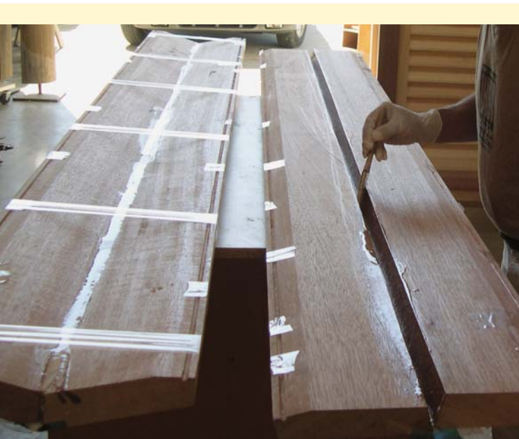
Figure 5. Here, bevel-edged mahogany planks for the railing cap are glued together with epoxy, the joint held snug with shipping tape until the adhesive cures (above). To create a flat bottom for mounting on the wall, a filler piece was added and bonded with more epoxy (right). Circular mounting blocks for the composite columns were installed in the shop (below); the lower disk matches the outside diameter while the upper receives screws driven through the column and concealed by decorative plinths. Note the weep holes for drainage and ventilation.