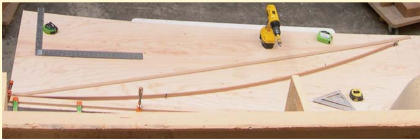
Figure 2. The arch-topped roof trusses are made from 2x4 chords skinned with \frac{3}{8} -inch plywood. To form a graceful curve, the author bent a flexible piece of pine between the roof's rise and run and traced the profile onto the plywood (above). The first half-rafter was carefully cut out, then used as a pattern for the others (above right). The plywood cutouts were joined end to end with plywood plates, then glued and stapled to both sides of the framing members, creating strong, lightweight trusses 16 feet long (bottom).