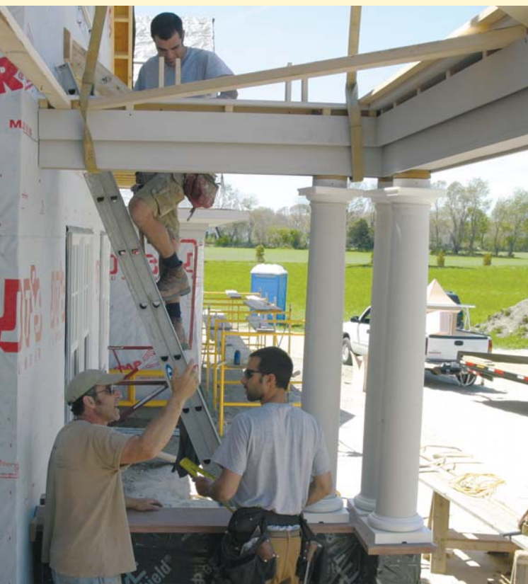
Figure 7. On site, the crew aligns and levels the deck frame over prepared concrete footings before bolting it to the building's rim joist (top left). Next, the flared half walls are dropped precisely into place and screwed to matching base plates already mounted to the deck framing (top right). After setting the columns, the crew installs the architrave (above); note the pairs of vertical pine rafter ties, ready to receive the trusses in the roof module.

The base plates for the half walls were already screwed to the deck frame in the shop. I patterned their locations directly from the architrave, ensuring accurate alignment with the column plugs overhead. All we had to do was to lift the two walls off the truck and fit them onto the base plates (Figure 7). We then lag-bolted the walls from underneath, through the base plates.