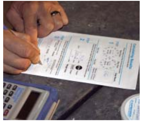
Figure 4. Some 60 to 72 hours after sealing the dome, the author slices it open and removes the container of calcium chloride (left). He then reweighs the container plus the tape that once sealed it (above left) and uses a formula provided by the manufacturer to calculate the moisture vapor emission rate — or MVER — of the slab (above right).

specifications to the client. I keep copies for myself just in case.