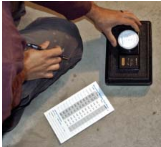
Figure 3. The calcium chloride test measures the amount of water vapor being emitted by the slab. To perform this test, the author weighs a prepackaged container of calcium chloride (right), opens it (below), and places it under an airtight plastic dome that seals to the slab with a peel-and-stick gasket (below right).

Whenever I install flooring over a slab, I perform calcium chloride tests and give a copy of the results and of the installation