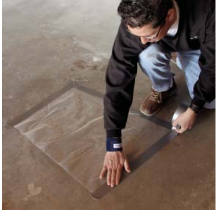
Figure 2. The traditional way to test for moisture is to tape a sheet of plastic to the slab, wait overnight, and then check whether condensation has formed underneath. If it has, the slab is too wet for flooring. But if it hasn't, the tester can deduce only that the slab might be dry enough for flooring.

In addition to the test kits, you will need a scale that reads