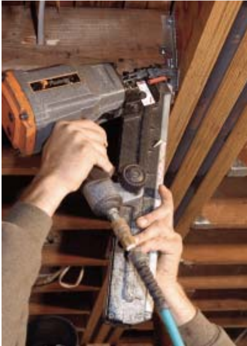
Figure 8. The author uses a Paslode Positive Placement pneumatic nailer to fasten the joist hangers to the beam and floor joists.