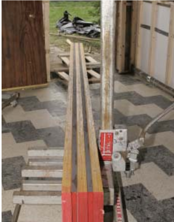
Figure 4. Once the beam was in position on the floor beneath the pocket, the second support wall could be assembled. Lateral and diagonal bracing strengthened the temporary walls and helped prevent individual studs from buckling under load.

Figure 3. To get the 800-pound beam into the house, the boom operator dropped one end onto a jack inside and the other onto a dolly outside. The author and his helper rolled the beam through the front door, then slid a second dolly under the tail end and pushed the whole assembly the rest of the way into position.