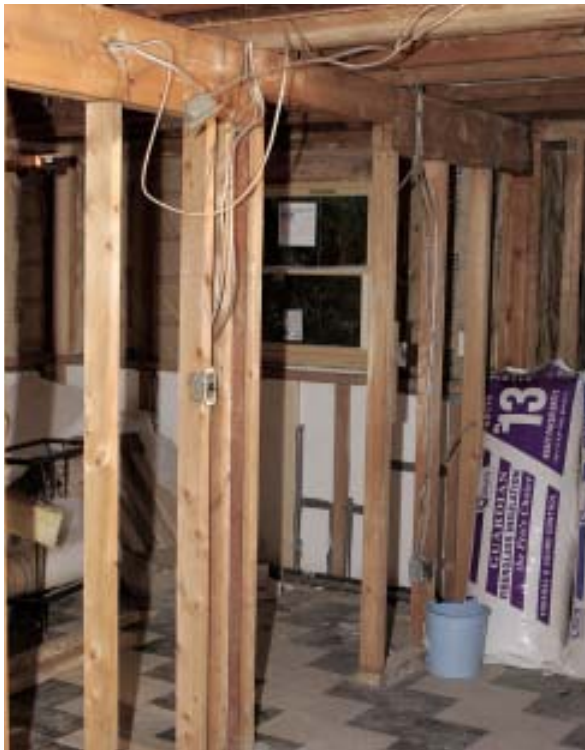
Figure 1. To open up the floor plan of a split-level home, the author removed this bearing wall and replaced it with an engineered beam. Matching the depth of the beam to the 2x8 floor framing maximized headroom and allowed the beam to be hidden by the ceiling finish.

Before loading the studs by removing the bearing wall, we ran horizontal 2x4s to connect the studs at midheight. This kind of lateral bracing helps prevent individual studs from bowing. We also