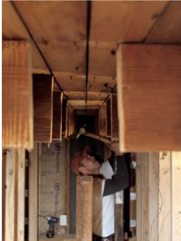
Figure 7. A worker uses 2x4 cribbing to lift the beam above the level of the jacks' support columns. Sections of the temporary wall's top plate were cut to make room for the jack arms.

Figure 6. Before the new beam could be raised into the pocket, any penetrating nails that might be pushed up through the sub-floor above had to be either cut off or clinched over.