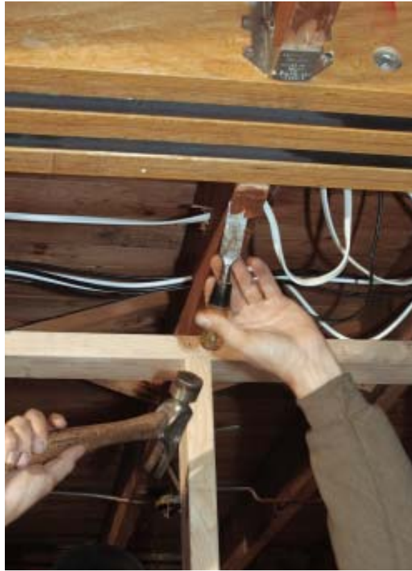
Figure 9. Where the floor joists are flush with the bottom edge of the beam, the author chisels out notches for the joist hangers.

moved, it was apparent that the sagging of the original structure prevented the beam from going completely flush with the existing framing.