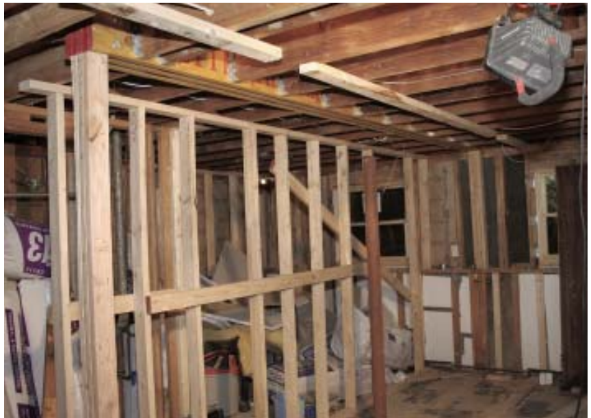
Figure 10. Once the joist hangers were installed on one side of the new beam, the author removed the temporary supporting wall.

Once all the hangers were in place, we removed the temporary walls (Figure 10). The entire job took approximately 4.5 hours and required two men. We paid $140 to rent the pair of Hi-Jacks for the day, which was much less expensive than paying four borrowed carpenters for 2 hours. And the jacks don't break for lunch.