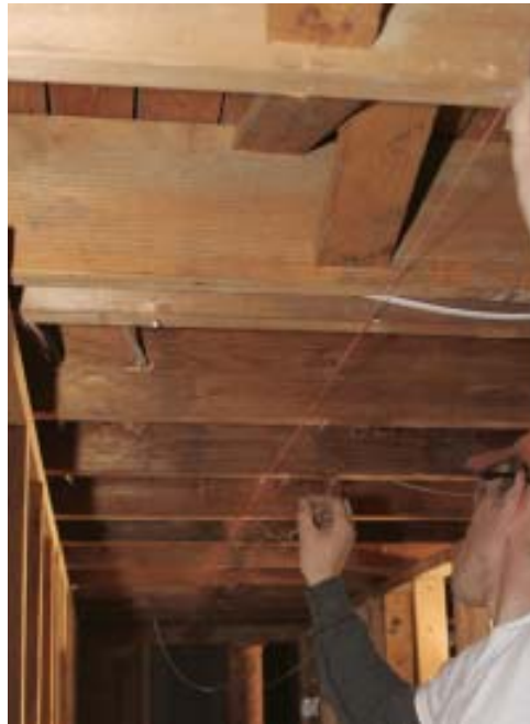
Figure 5. After laying out the new 7⅝-inch-wide beam pocket, the author's helper snaps chalk lines (left), then uses a small square to mark cut lines on the joists (below). Starting kerfs with a circular saw (bottom left) and finishing up with a recip saw produced clean, straight cuts. The author set the recip-saw blade so that it just barely cut through the 2x8 joist, and he gave the tool a slight backward tilt to prevent the blade from wandering off the cut line (bottom right).

Because of their design, though, the Hi-Jacks couldn't lift the beam all the way up into the pocket. To hoist it the last 6 or so inches into place, we had to place cribbing between it and the lift. We did this by raising the beam as high as we could into the pocket (to keep it from rotating) and temporarily posting one end, which allowed us to lower the jack on that end and block under the beam