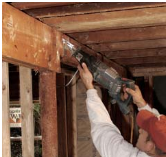
Figure 2. After building the first temporary support wall, a carpenter removes most of the old bearing wall. Had the floor joists broken over the bearing wall, as is often the case, both temporary walls would have needed to be in place before removing the old framing.

It's also good practice to go upstairs and make written notes of any uneven-