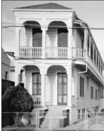
The early “shotgun” homes (above) of New Orleans (so-called because they had no hallways and each room opened into the next all the way through the house), were built on piers at least 3 feet high in anticipation of flooding, and they traditionally included wind-resistant hip roofs.