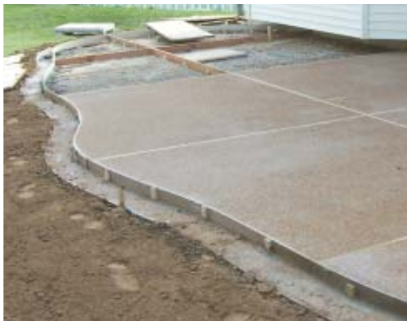
Figure 5. The edge of this slab was formed to accept a brick head course. There was too much concrete to pour and finish in a single day, so the crew stopped at a joint.