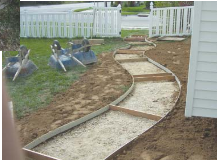
Figure 3. This walk was formed with 1/4 -inch Masonite. The cedar crossmembers function as expansion joints but will also be left in place as a decorative element.