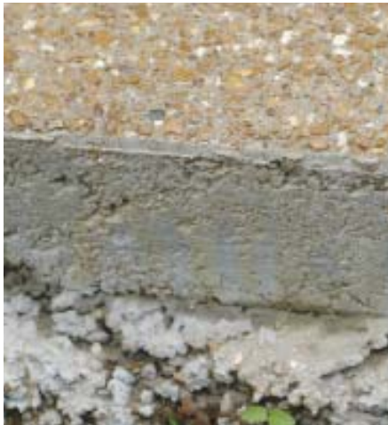
Figure 1. The same aggregate that is visible on top is dispersed throughout this slab. Some of it even shows through on the sides.

than building the entire patio from brick or stone and it creates more visual interest.