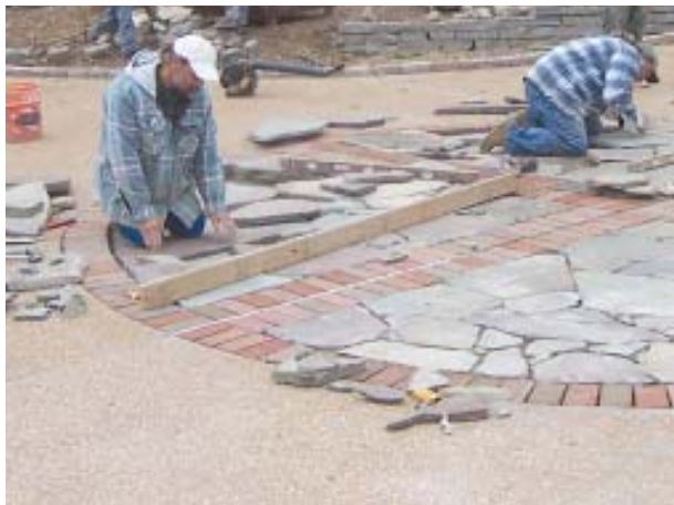
Figure 12. At left, the author's crew cuts stone to form an inset medallion in an aggregate finish driveway. Below, a brick head course set into a patio waits to be grouted.