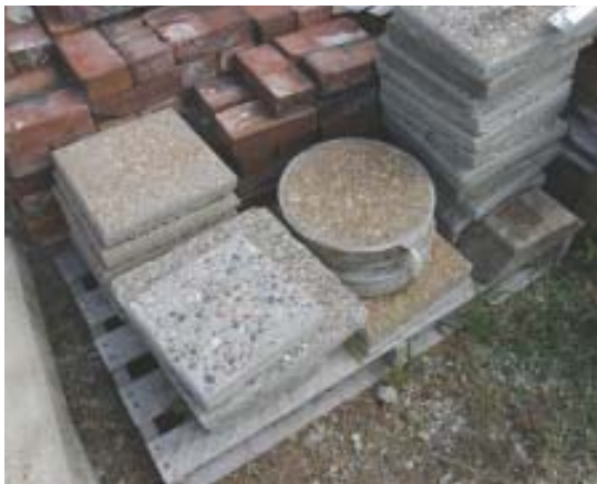
Figure 2. The author makes samples containing different types of aggregate for potential customers.

Size. Some contractors like to use normal size ( 3/4 -inch to 1\frac{1}{2} -inch) stone when doing an exposed aggregate finish. I don't like doing this because if the concrete is a little too wet, you can end up with areas where