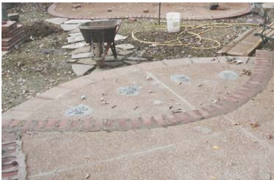
Figure 13. Here, crew members have grouted the masonry joints. They will finish them by screeding flush to the brick and sponge-cleaning the area with water.