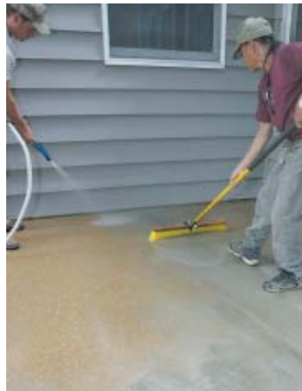
Figure 11. The aggregate is exposed by washing away the top layer of cement. While most of this slab is already hard, the top layer is fresh because it was sprayed with a retarder.

pump-up garden sprayer. Oil-based products are also available. The retarder has some color to it so you can tell if you've missed any spots, but it will not stain the concrete.