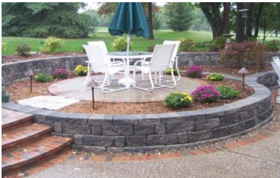
Figure 4. Inset masonry creates visual interest by breaking up what would otherwise be a monotonous expanse of a single material.