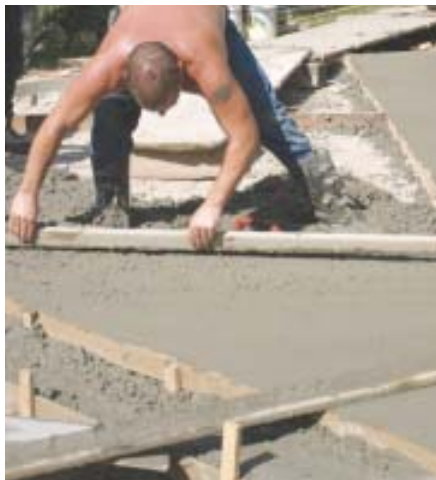
Figure 8. The expansion joints are flush to the forms, so the author's crew can level the concrete by screeding across them with a strike-off board.

Nowadays, finishers use a chemical retarder to slow down the rate of setting at the surface of the slab. The product we use is mixed with water and sprayed onto the freshly floated surface with a