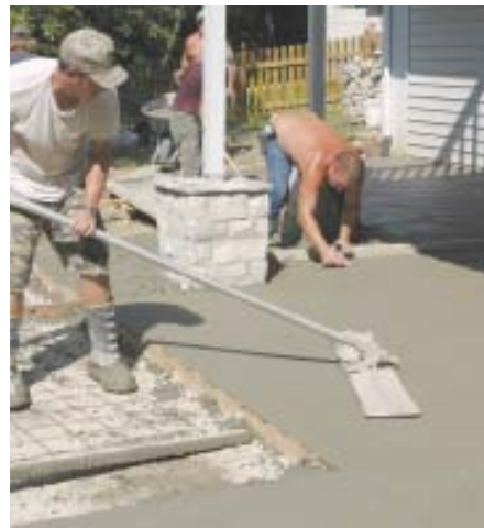
Figure 9. A bull float removes any unevenness produced by striking off the concrete.