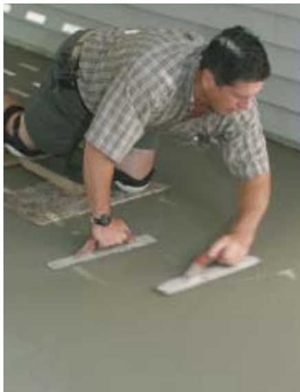
Figure 10. Here, the author uses magnesium hand floats to do the final surfacing of the concrete. This is the last thing done before the retarder is sprayed onto the slab.