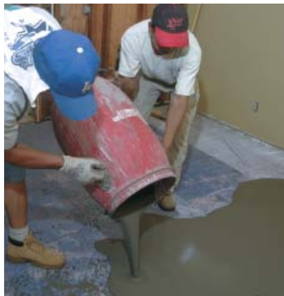
Workers combine a ready-mix topping product with water (top). It's also possible to buy liquid polymer and add it to conventional dry materials. The overlay is then poured over a wood-frame floor (above). Note the diamond lath nailed over the blue CIS crack isolation membrane.