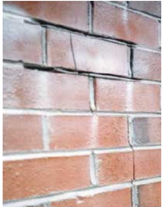
Figure 1. A vertical crack in the brick veneer is often the result of minor settlement in the foundation. Though these cracks typically stop moving and cause no structural problems, most homeowners like them repaired.

Remedial work at the ground level can include regrading for positive drainage, excavating to add or improve upon existing drain tiles and foundation waterproofing, and in the most extreme situations digging below an existing footing to pour a wider base of concrete on stable ground. For