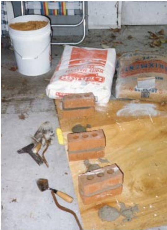
Figure 4. A variety of ingredients make it possible to match existing mortar: white, tan, and gray mortar mixes, black mortar tint to darken the mix if needed, and white and orange sand. Shown in the foreground are some drying samples.