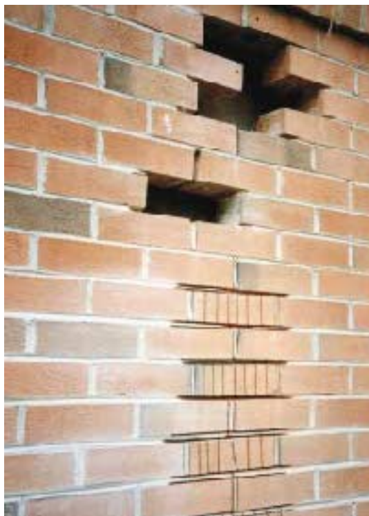
Figure 2. Using an angle grinder, the author scores the mortar joints and cuts the bricks to be removed into small sections. He finishes the removal process with drill bits and cold chisels.

Matching mortar is crucial, and a little extra care makes all the difference between a repair that disappears and one