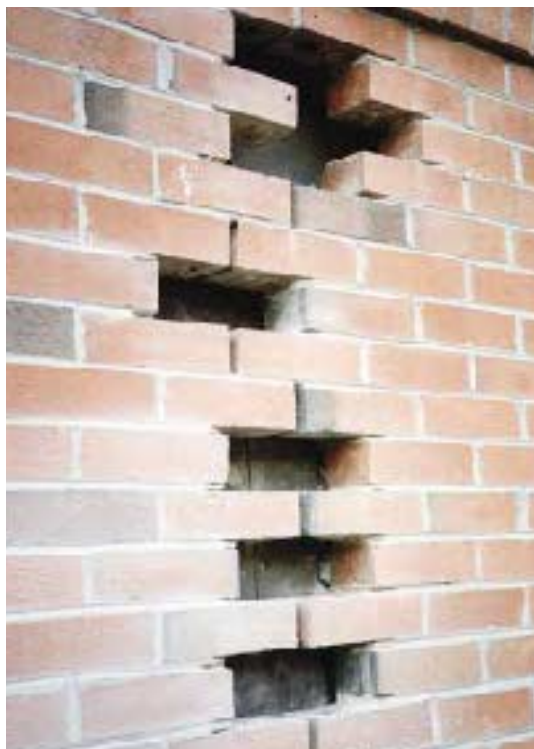
Figure 3. Working slowly, the author removes the cracked bricks without damaging nearby bricks.