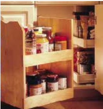
A turnout shelf swings out of the cabinet, independent of the door, giving access to a pair of rollout shelves inside.