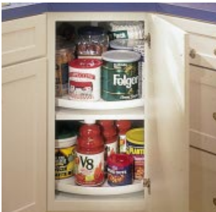
A diagonal-faced cabinet makes room for a full-round carousel. Compared with a corner cabinet, a diagonal approach feels less cramped.