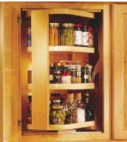
An oval-shaped rotating shelf is a classy upgrade for base and wall cabinets.

Corners are the crux of cabinet layout. There are quite a few ways to handle corners, including L-shaped cabinets, blind corners, diagonal fronts, and even open shelving. What you or the client choose will depend on available space, accessibility, aesthetics, and room configuration. The best solutions come from experience, not an unlimited budget, so study lots of designs and draw your own conclusions.