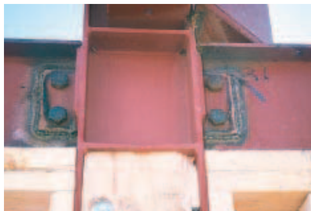
Figure 4. Steel I-beams can be prepunched for bolts; with tube steel, it's easiest to fasten lumber with powder-actuated fasteners.