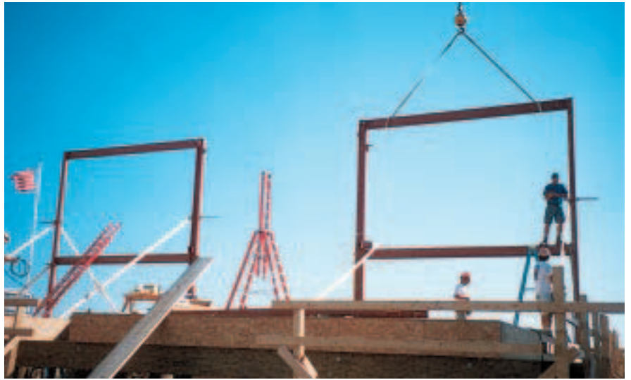
Figure 3. The author erected the moment frame in two main sections, then dropped connecting beams into place.

Because the frame stood two stories tall, it was a little tricky to plumb. We used our 8-foot level to plumb and brace the bottom 10 feet of the frame. We then welded the moment connections at the first-floor level, and built the first-floor walls around the frame. We next built the second-floor platform, checked the upper sections of the moment frame for plumb, and welded the upper connections.